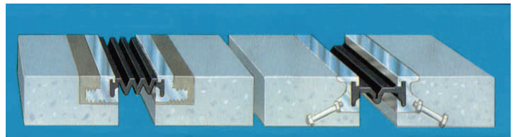
Typical Steel Strip Seal Expansion Joint System

The only drawback with this system is the top of the joint glands do not comply with ADA regulations, nor do they offer much foot support. As can be seen in the drawings above, there is virtually no foot support for pedestrians, just a “V” three to four inches deep. Metal cover plates are employed to bring the joint system into compliance.