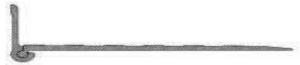
Floor to Wall