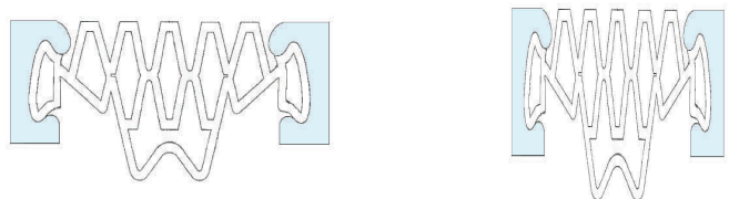
Expansion Joint Seal developed for garage rehab (left, expanded; right, contracted)

To meet the requirements specified for the project while still using the existing steel extrusions, a seal was developed specifically for this application (see drawing below). The multi-chambered seal allows for the movement specified (lateral, slab deflection and potential longitudinal) while providing sufficient support for foot traffic and meeting ADA requirements. The ability to install the seal in the existing steel extrusions allowed the repair to be completed in a very cost-effective and efficient manner.