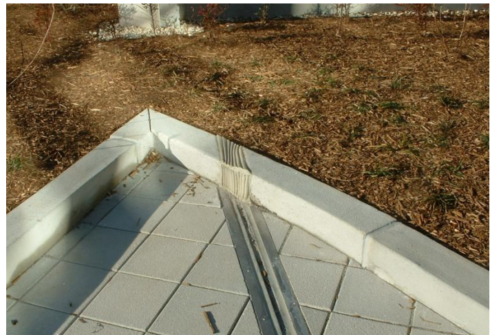
Curbs on plaza decks where different types of expansion joint are required to be interfaced.