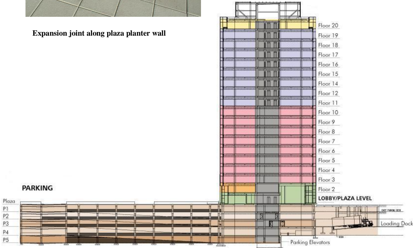
Diagram of Phipps Tower and Parking Garage