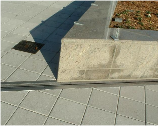
Expansion joint along plaza planter wall